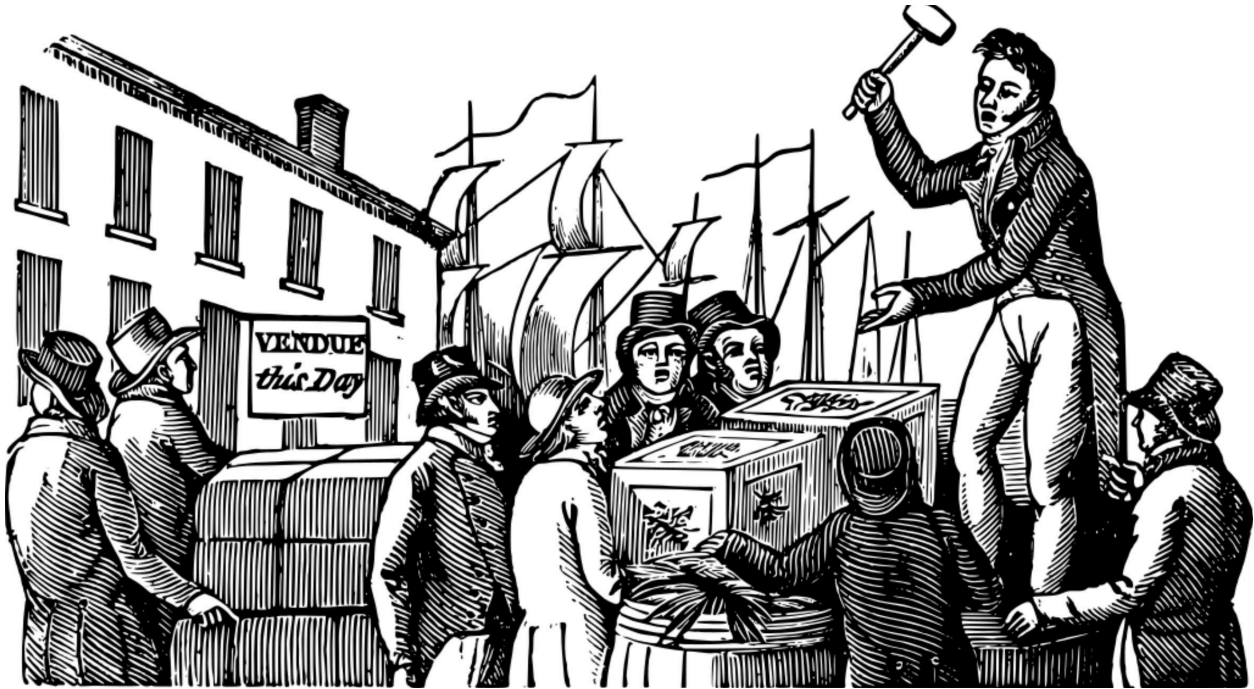
Advertising an auction on a dock from 1830 found here