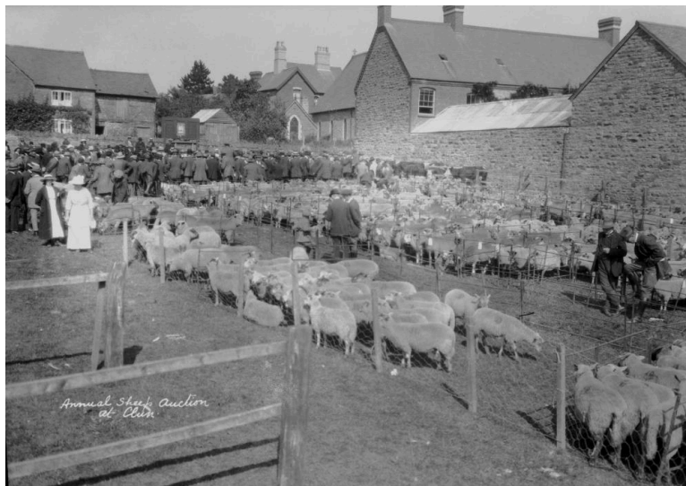
Annual Sheep auction at CLUN found here

Listen to this short example of an auctioneer belting the auction cry.