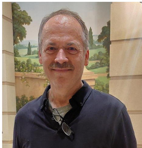
Will Shortz at the 2023 American Crossword Puzzle Tournament found here

The size of the crosswords also follow a pattern in the NYT. Weekdays are usually 15 x 15 while weekend puzzles could be 21 x 21, 23 x 23, or 25 x 25. According to GUINNESS, the largest published crossword has 66,666 clues! The puzzle has 33,018 across and 33,648 down and was published in 2016 in TOKYO, Japan. The massive game spanned 129.61 square feet which is about the same size as an average apartment bedroom!