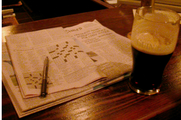
New York Times Crossword found here

Many people have cursed WILL SHORTZ over the years. Before the hunched shoulders of the IPHONE era, there was the curved neck and tense shoulders of those dedicated to the CROSSWORD puzzle. White knuckles on a number 2 pencil, pink eraser bits, coffee rings on a Sunday morning paper; this was living.